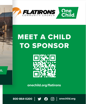
WEB CARD (FRONT AND BACK)