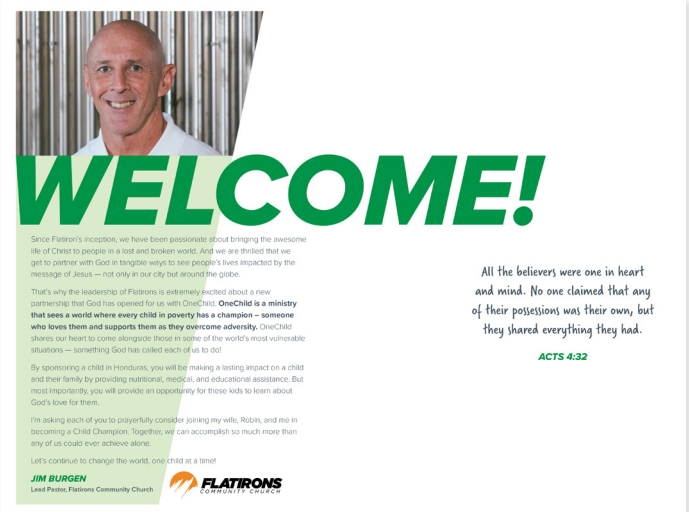
WELCOME KIT (LETTER)