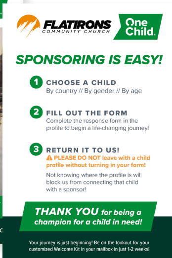
TABLE TENT (FRONT AND BACK)